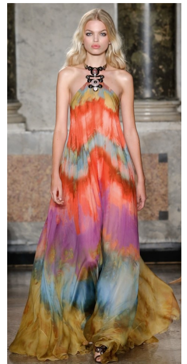
Pucci 2015 spring/summer